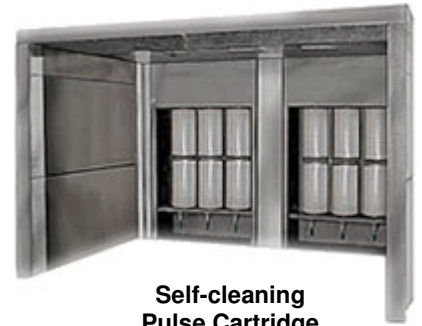
Self-cleaning Pulse Cartridge