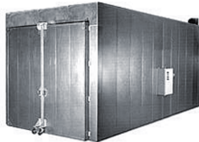
Gas-fired or Electric